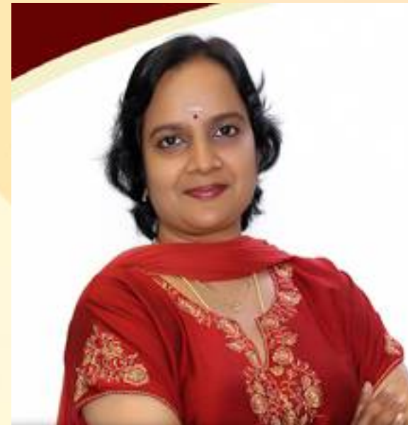
Mdm Gowri Tamil Language